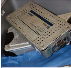
Used surgical instruments arrive from theatre

In the last edition we announced that sterile services had won the service commitment team award: now we bring a “behind the scenes” look at the crucial role they play.