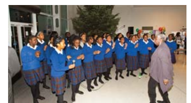
Gospel singers from Maria Fidelis Convent School (above)