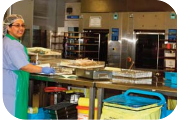
Equipment ready for coding prior to washing process