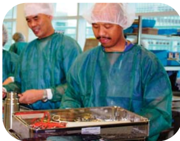
After washing, items are individually inspected and tracked

bags in an ultra sterile room; steamed at high temperatures (up to 137°C for three minutes);