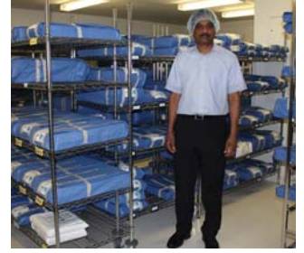
After sterilising and wrapping packs are stored ready for use